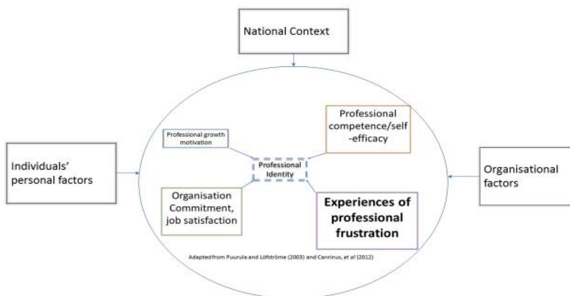
Figure 2: A refined conceptual framework

The different sizes of the text boxes convey the comparative contribution of the elements to the development of professional identity. In order of impact, these are, firstly experiences of professional frustration, professional competence/self-efficacy, and commitment to the organisation, job satisfaction and finally professional growth motivation. The research indicates that experience of professional frustration has a greater impact than the professional growth motivations of an individual to their development of professional identity. This links with the job satisfaction and commitment to the organisation, as experience of professional frustration can contribute to negative feelings towards the organisation. Professional competence/self-efficacy are in turn diluted by professional frustration. These findings also show that a reduced sense of agency is detrimental to a participant's professional identity. Accordingly, to accommodate external factors that influence the professional identity journey, both positively and negatively a further revision of the conceptual framework is necessary.