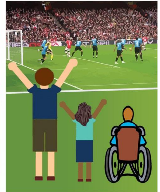
SOCIAL JUSTICE 11